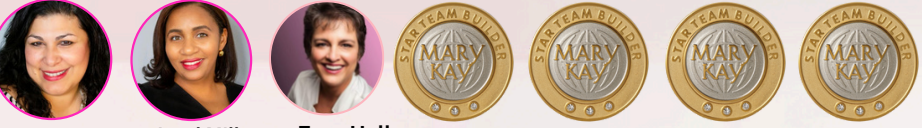
Lynelle Colon Janel Mills Zory Hall